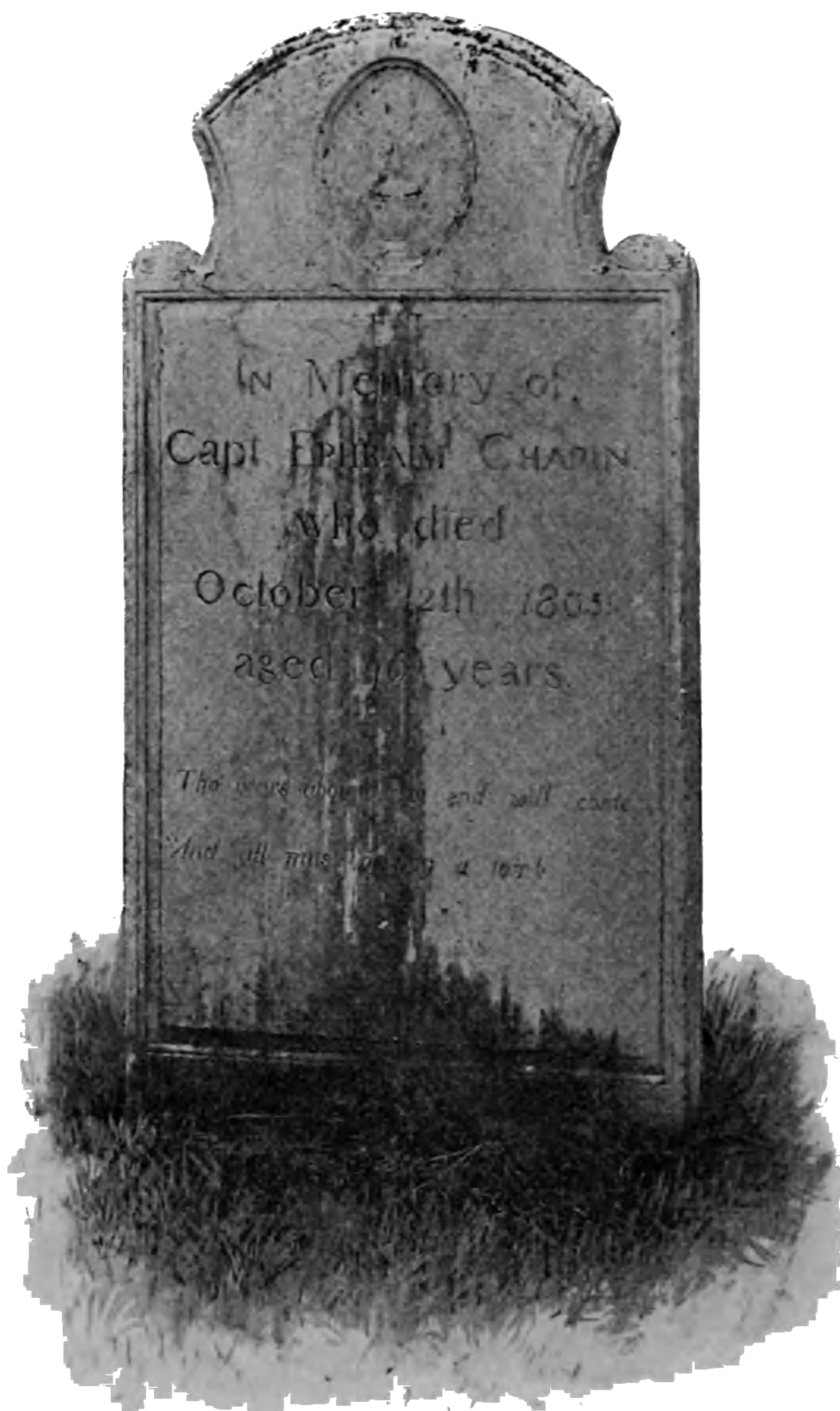
CHICOPEE (STREET) BURYING GROUND.