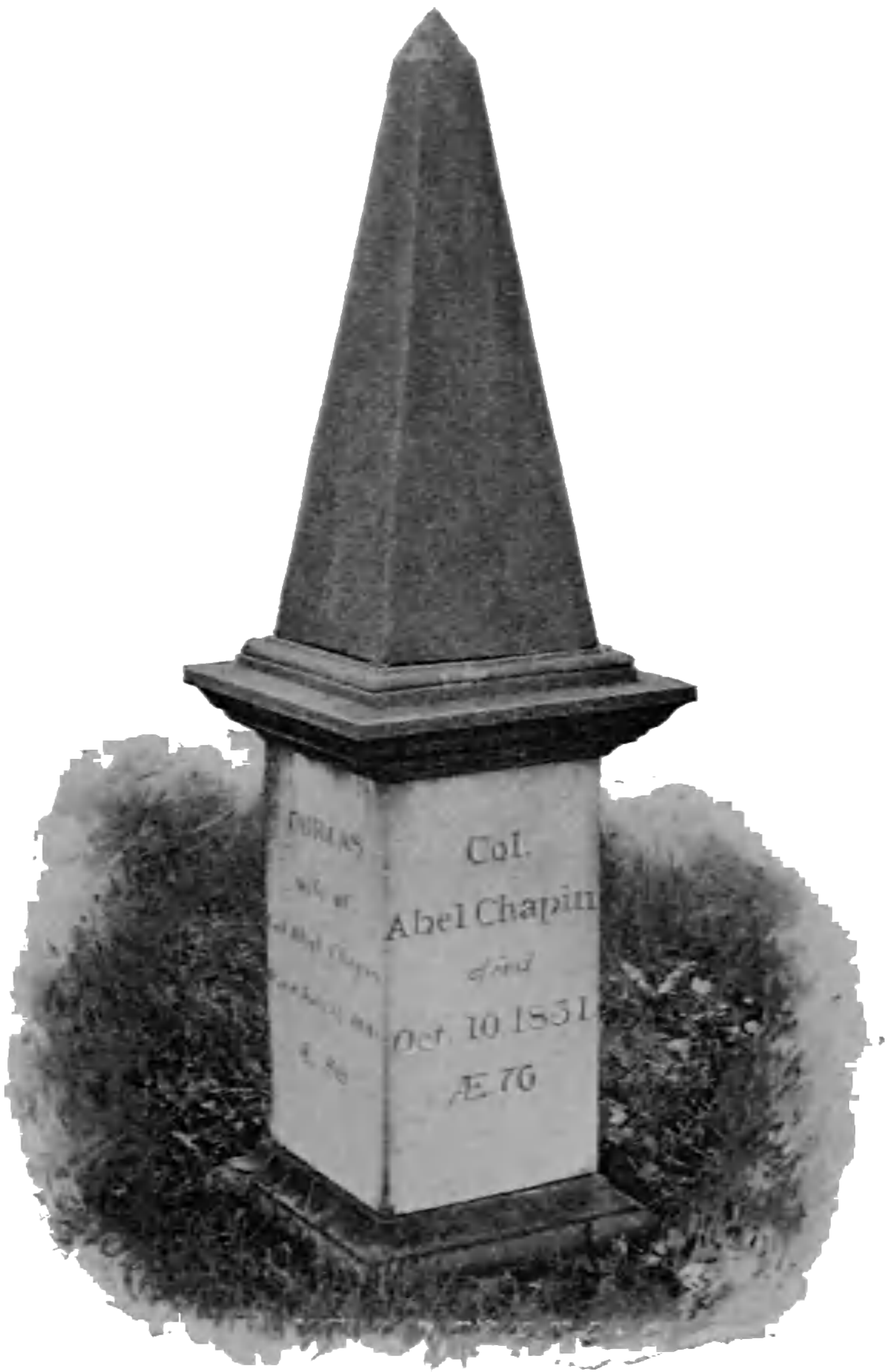
CHICOPEE (STREET) BURYING GROUND.