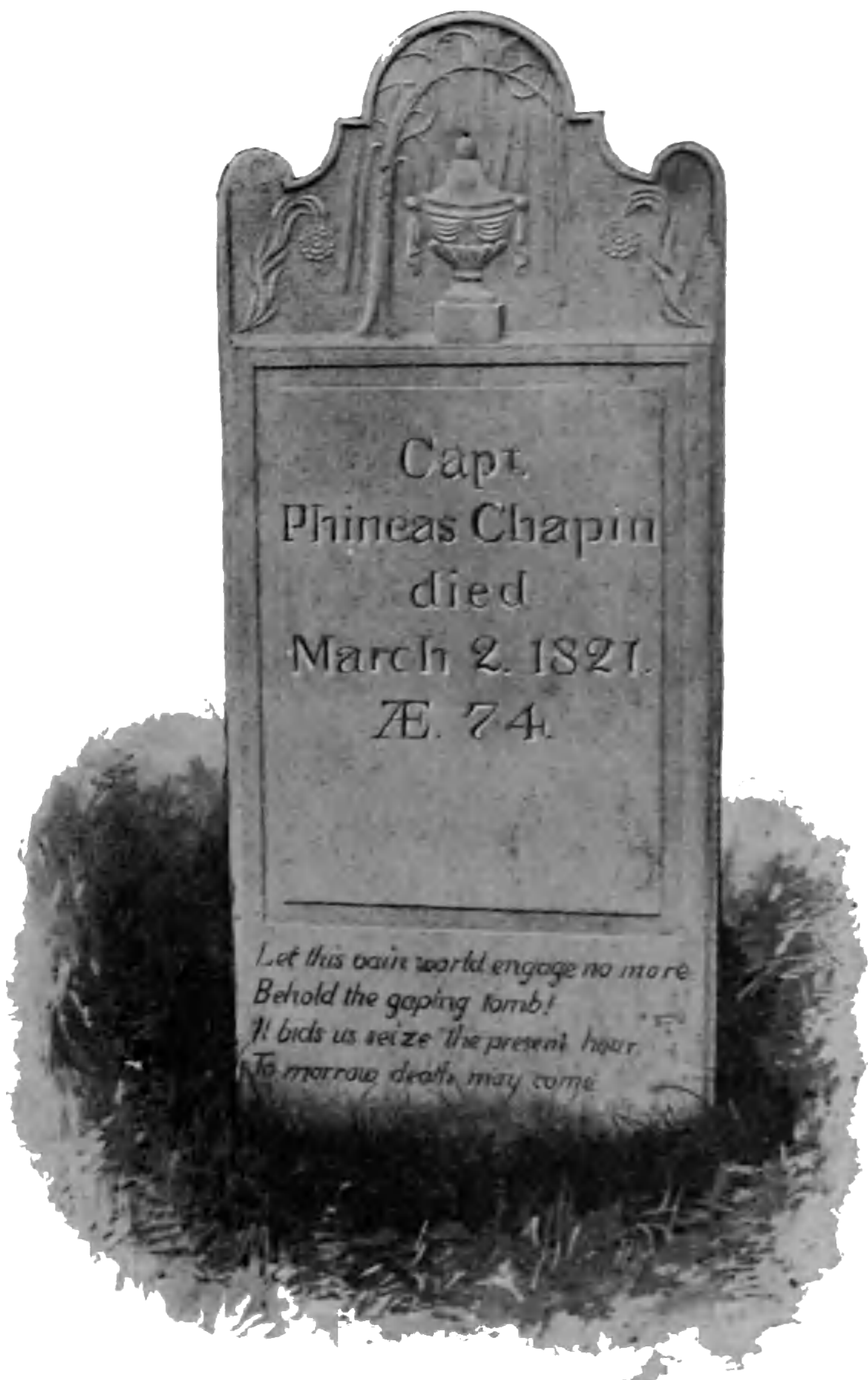
CHICOPEE (STREET) BURYPING GROUND.